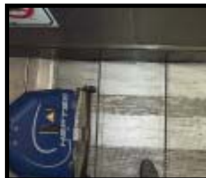
RF 40 AUTOMATIC STEP CLEANING