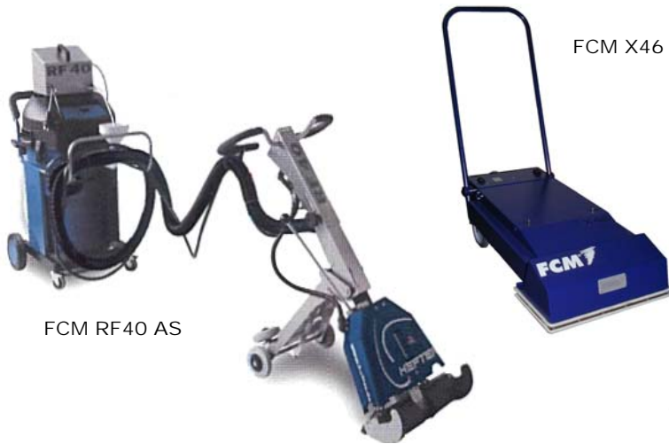
FCM RF40 AS