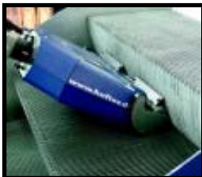
RF40 ALLOWS CLEANING OF RISERS